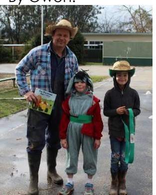
On book week I dressed up as Eeyore from Winnie the Pooh. I dressed up as Eeyore because Eeyore is cute and I am cute. By Vera.